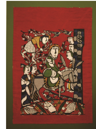
Sadao Watanabe - Christ enters Jerusalem

In verse 11, having entered Jerusalem, Jesus looks round and then goes back to Bethany. Why have such an anticlimactic ending to the story?