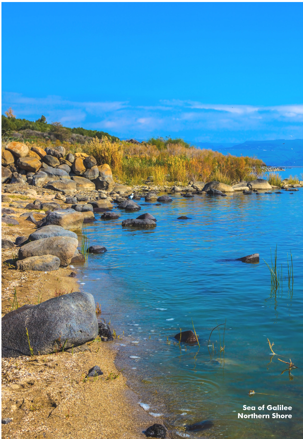
Sea of Galilee Northern Shore