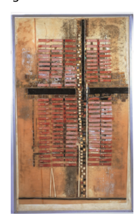
Michael Edmonds - The cross over the city