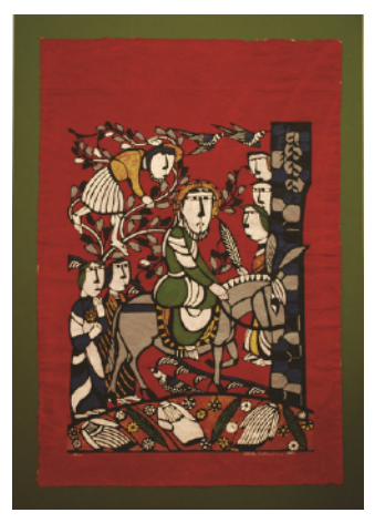
Sadao Watanahe - Christ enters Jerusalem